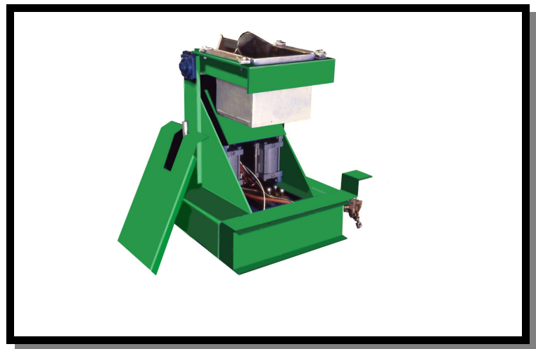
Semi Auto Pour Assembly Back View